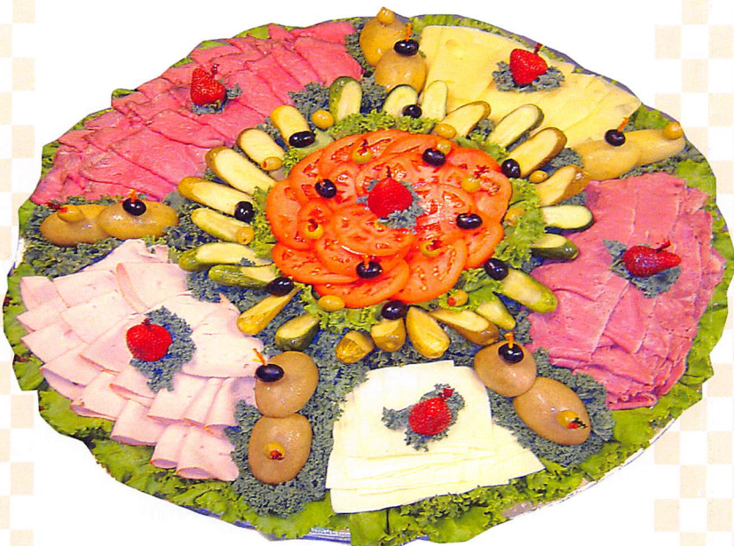
(Actual Presentations May Differ From Illustrations.)

Potato Salad • Coleslaw • Macaroni Salad Vegetable Pasta Salad Red Skin Potato Salad • Cucumber Salad